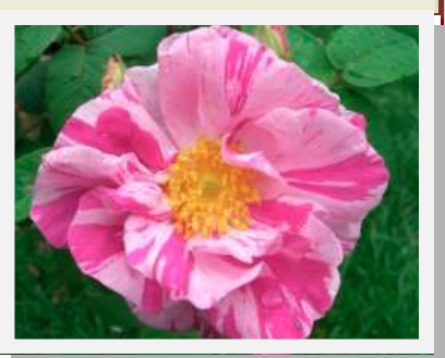
R. gallica versicolor

Of course, the first rule for showing winning roses is to grow healthy roses no matter what the type or variety. And if you are intent on winning, grow the varieties that do well in shows.