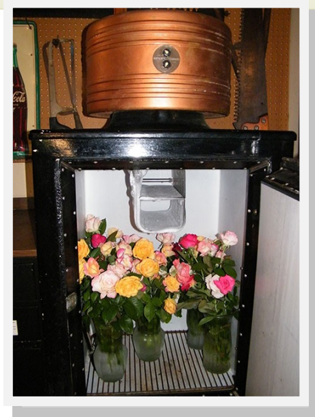
The Wedekind's Antique Refrigerator

Consider the placement of your bushes. Is there a better location for them in your yard? Remember that wind is more likely to damage your roses than freezing temperatures. Prune your roses and be sure to remove all the leaves. Seal all of the cut canes with Elmer's Glue. (I seal all my canes with Elmer's Glue every time I cut a bloom or prune.) Clean all debris from the soil. Cut the bottom out of another pot and put it over the bush. Pour the same soil mix as the rose is planted in into the top container to cover the bush.