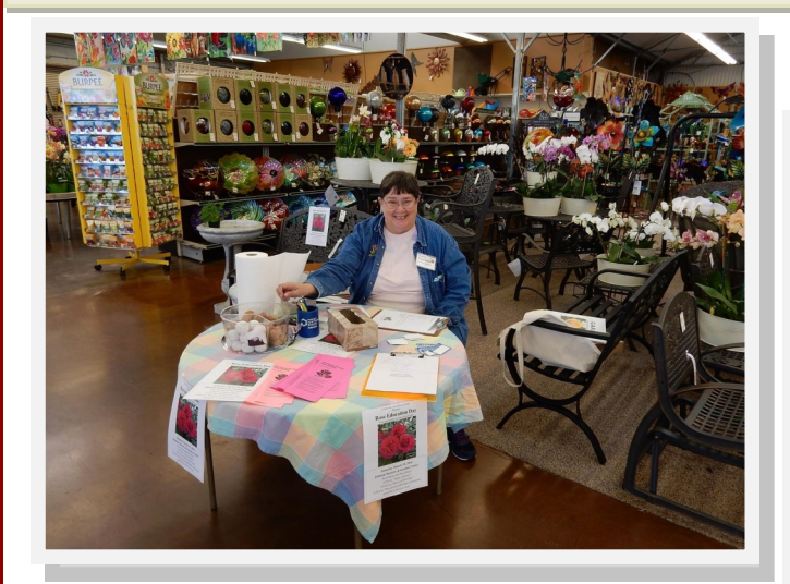
Cookeville Area Rose Society held Rose Education Day in March.