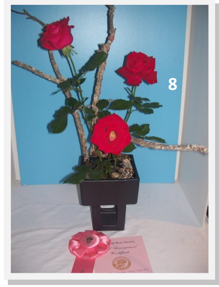
Complete show results and photos at www.tenarky.org