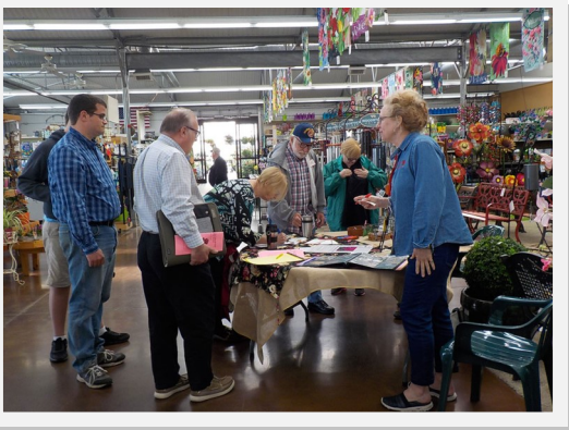
Registration at Rose Education Day