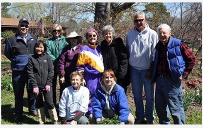
Nashville Rose Society Pruning Party