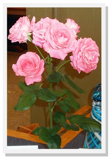
'America' Best of Show & Best Climber-Marty Reich