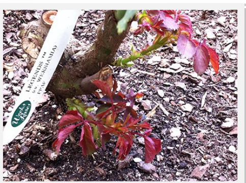
'Legends' Basal Breaks in July