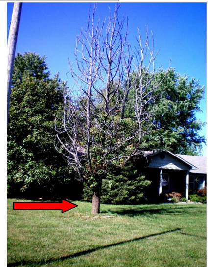
Example 2 shows a tree well on its way to death. Close inspection will note, however, full foliage still near the bottom of the tree.