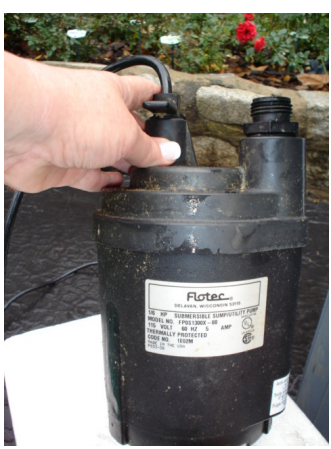
Linda's $60 1/6 HP Flotec Sump Pump

method has allowed me to increase the size of my garden. When it comes to roses I still believe more is better.