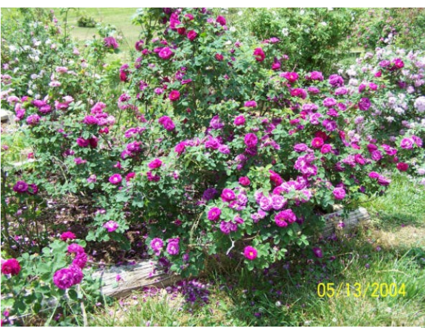
Gypsy Boy, a once-bloomer.

really coincidental that these are the University of Tennessee's colors. never liked orange roses until we moved out to the country where the color orange works well with our green eastern woods a backdrop." The