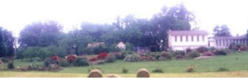
The Pecks front garden in Tennessee, near the Holston River is surrounded by hay fields and woods.

to rose growing has been quite different. "He tolerated my roses until he got interested in the historic side of the Old Gar-