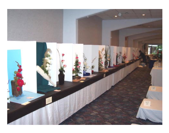
One whole wall of large —flowered arrangements filled the Holiday Inn.