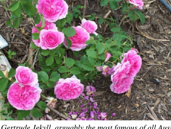
Gertrude Jekyll, arguably the most famous of all Austin i n g Roses.

The Pecks also use no winter protection for their planted roses, but